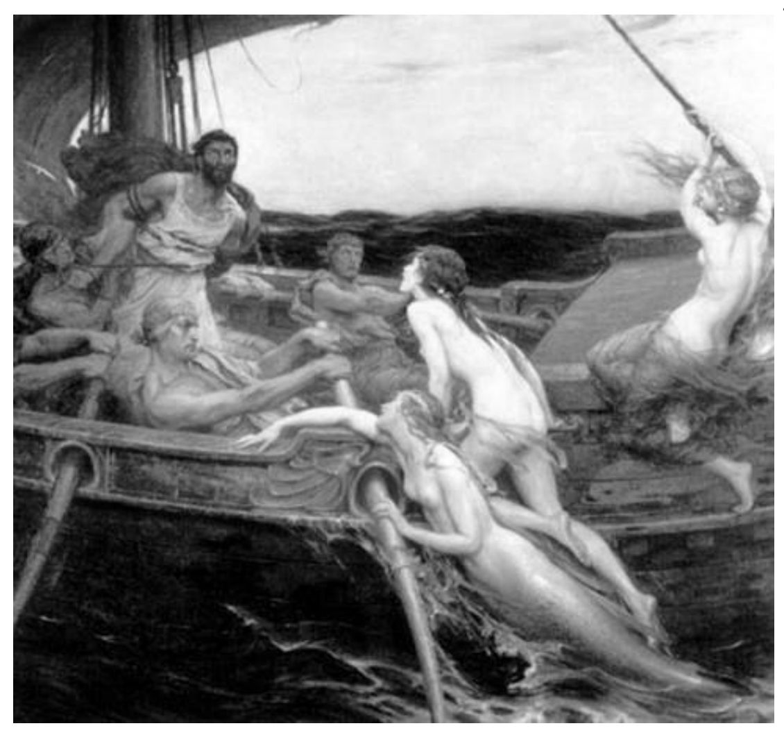
Tied to the mast His sailors' ears filled with wax To get the most out of his quest Odysseus puts himself In the abyss Separating two realms. Were the sirens out to kill? Can a human being actually imagine A mermaid is like themselves? "But what of negative and evil mermaids?" She is of nature. "But what of the riptide, the undertow, the storm surge, The whirlpool, the tsunami, the rogue wave,